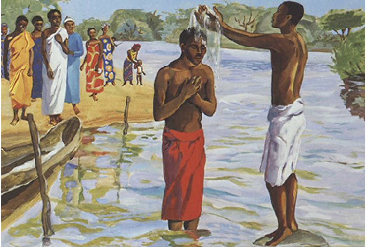
John Baptizes Jesus