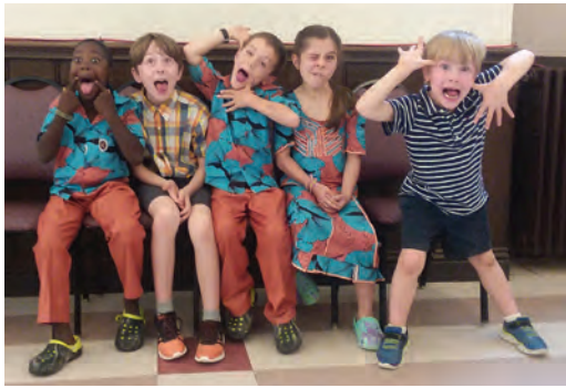
First Pres and Ludwig kids having fun together.