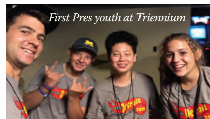
First Pres youth at Triennium