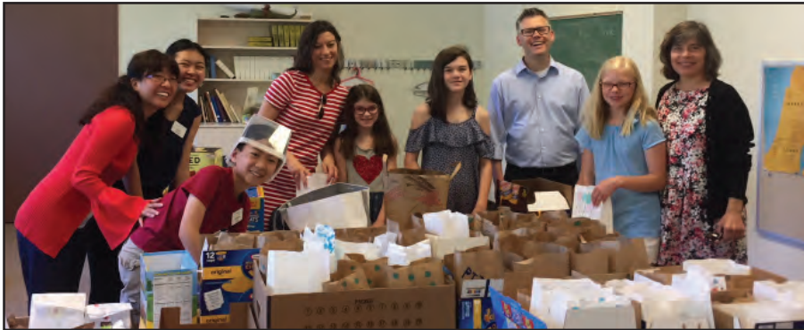
Thanks to all that donated to the Lunches with Love Milestone project for our fifth graders, close to 600 lunches were delivered to Food Gatherers.