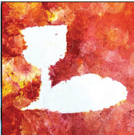
Art in action .... before and after pictures from the Messy Living Art event.