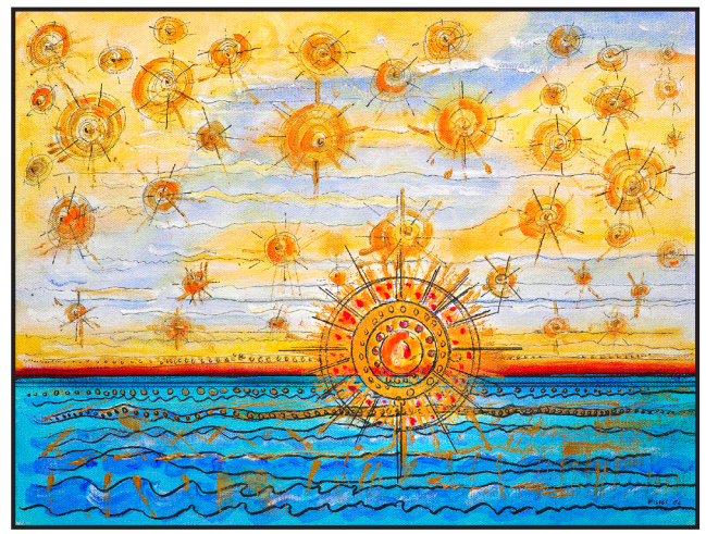
Morning Star © 2014 James Fissel | Eyekons