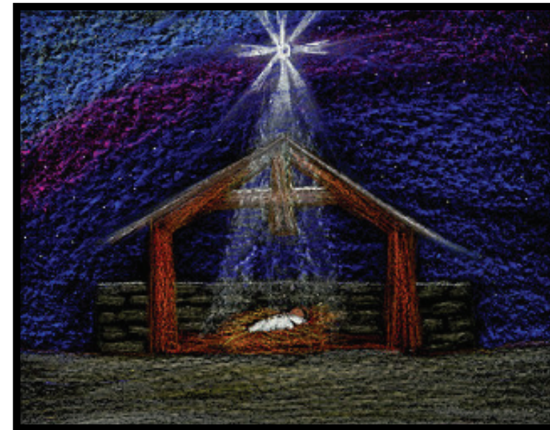
Heavenly Peace

We gather today to celebrate the nativity of Christ and the mystery of the incarnation. "Whereas during Advent we anticipate the fulfillment of the Old Testament prophecies of the Messiah, at Christmas we identify with the angels who proclaimed, 'Glory to God in the highest'; with the shepherds, who were afraid but nevertheless offered worship; and with Mary, who pondered the meaning of these events in her heart (Luke 2:13-20)." – from The Worship Sourcebook