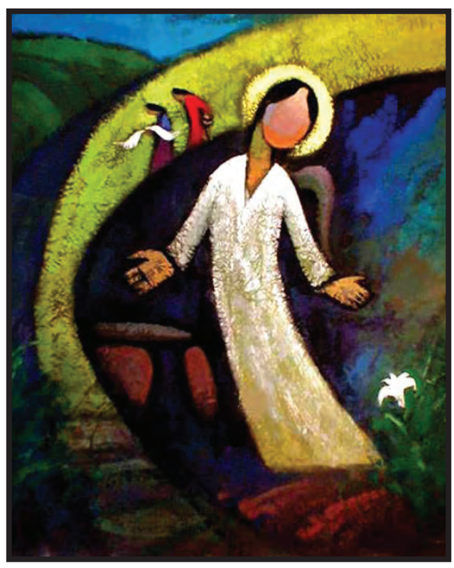
He Is Not Here He Qi © 2013 All rights reserved.