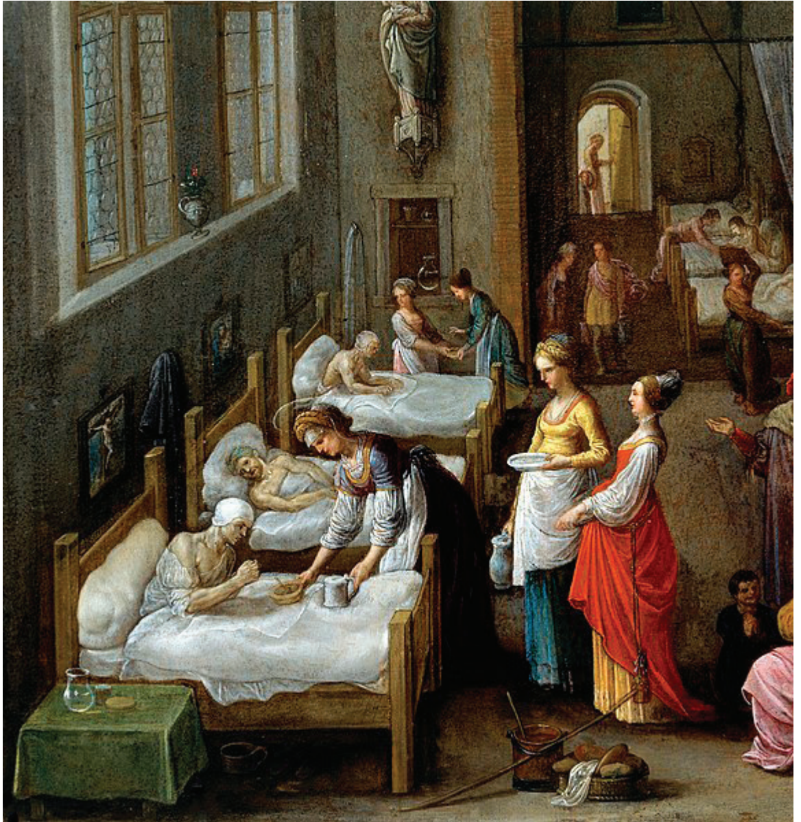
“Elizabeth Visiting a Hospital” Adam Elsheimer