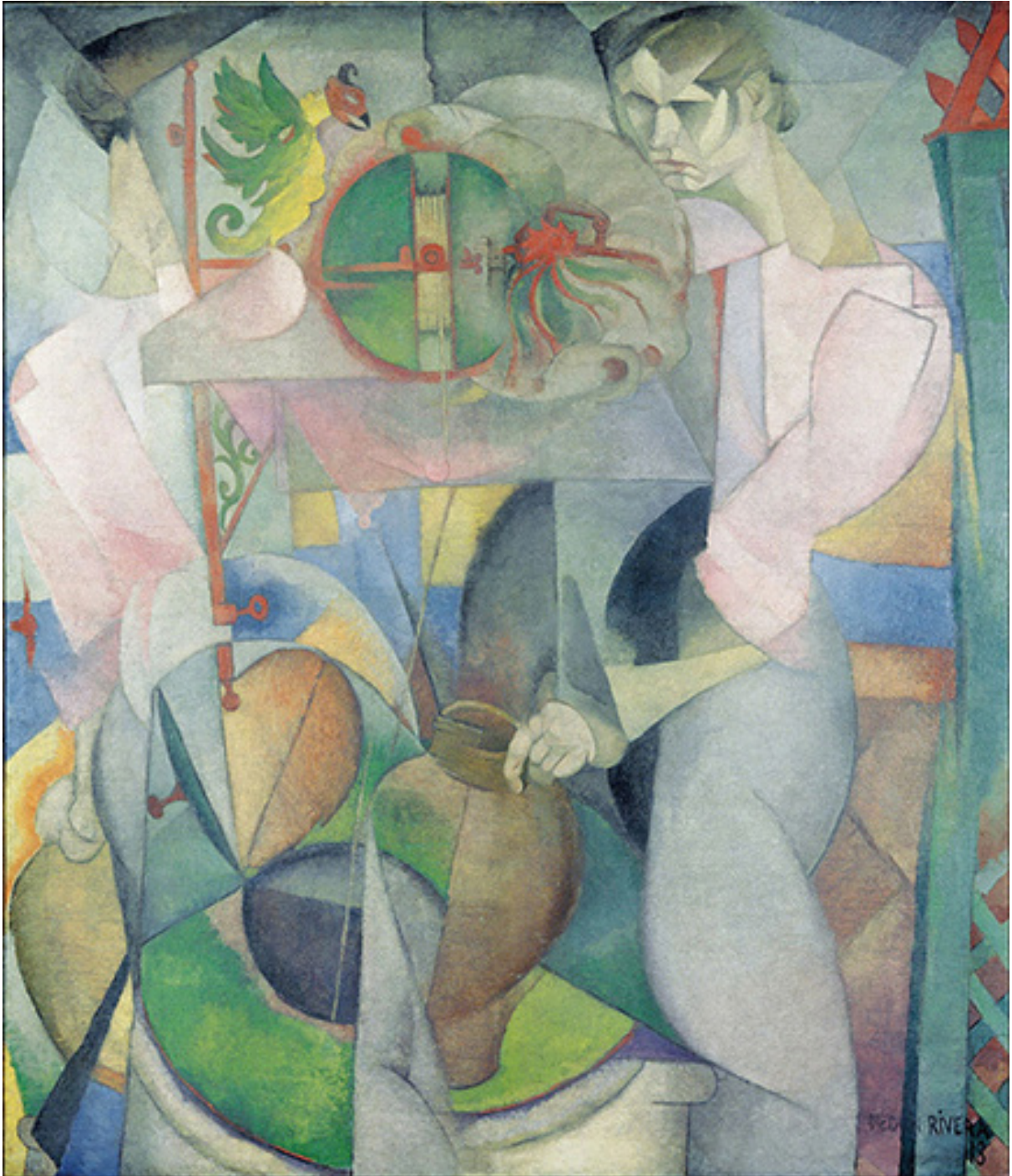
Women at the Well Diego Rivera