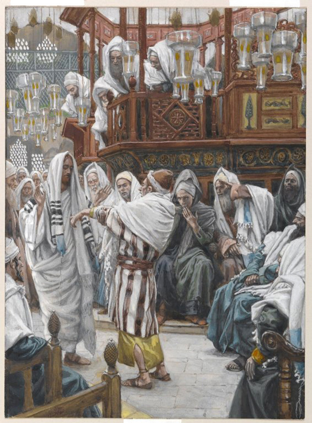
"Man with the Withered Hand" by James Tissot

SECOND SUNDAY after PENTECOST June 2, 2024 • 9:30 AM