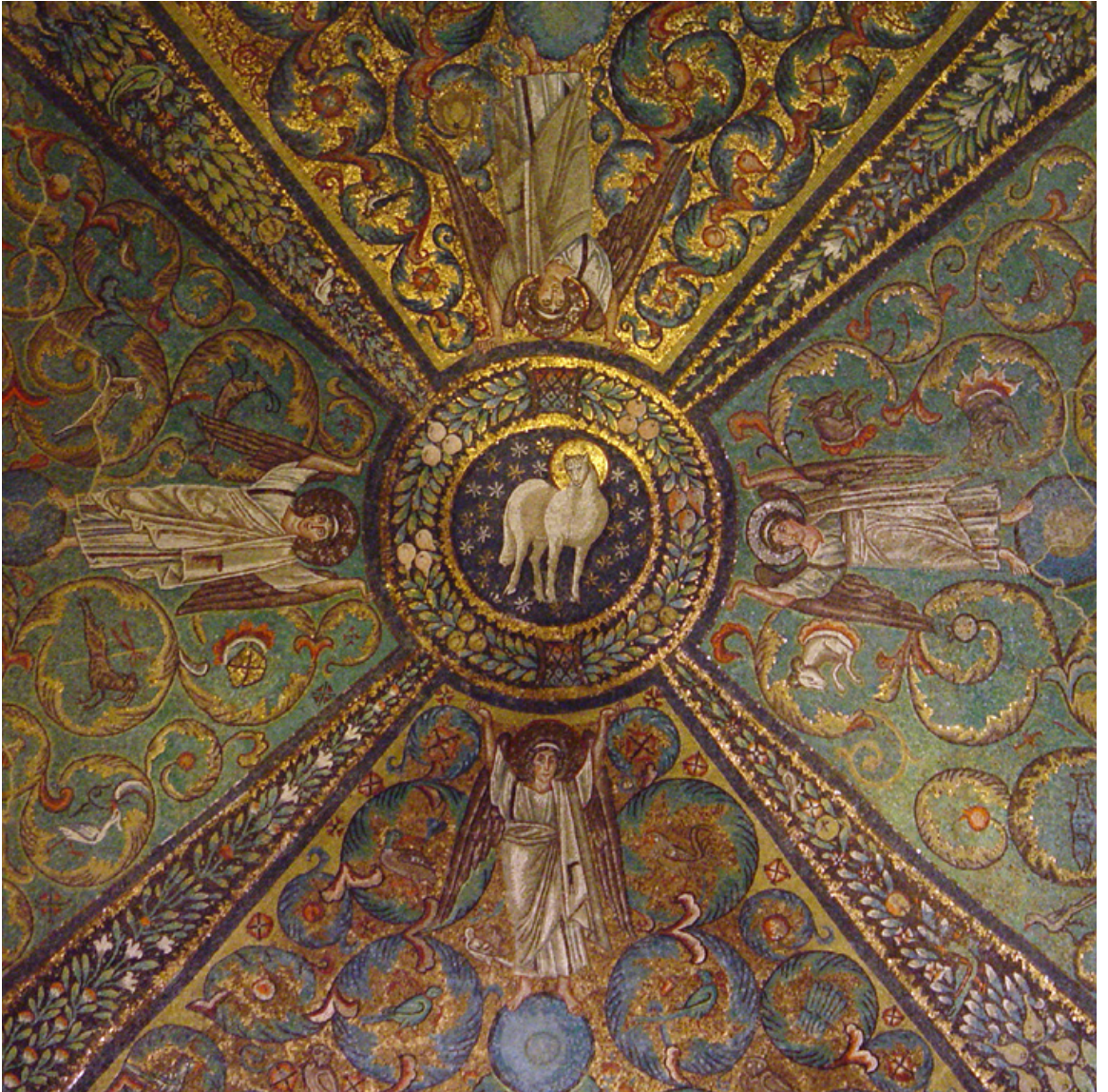
Agnus Dei, San Vitale Ravenna