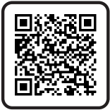
ONLINE FRIENDSHIP PAD

If you are a guest with us today, we encourage you to wear a rose window button that you can find just outside the Sanctuary in a basket. Wearing this button helps us know that you are new among us so that we can reach out to you with a fuller welcome.