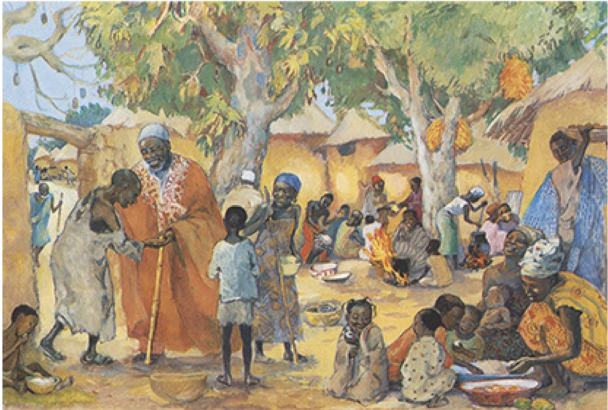
The Poor Invited to the Feast JESUS MAFA