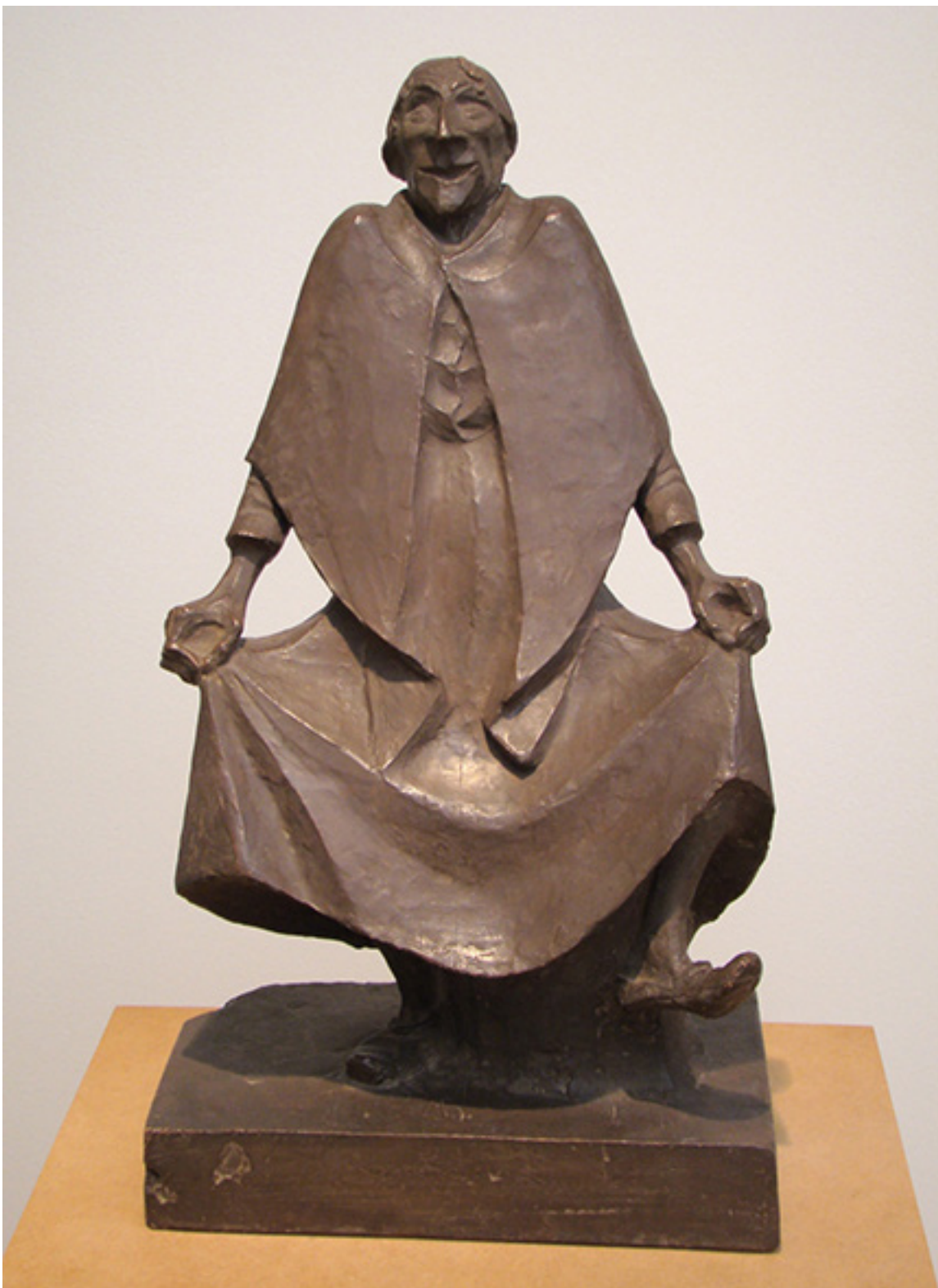
Old Woman Dancing Ernst Barlach