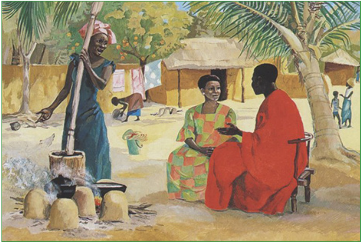
Martha and Mary JESUS MAFA