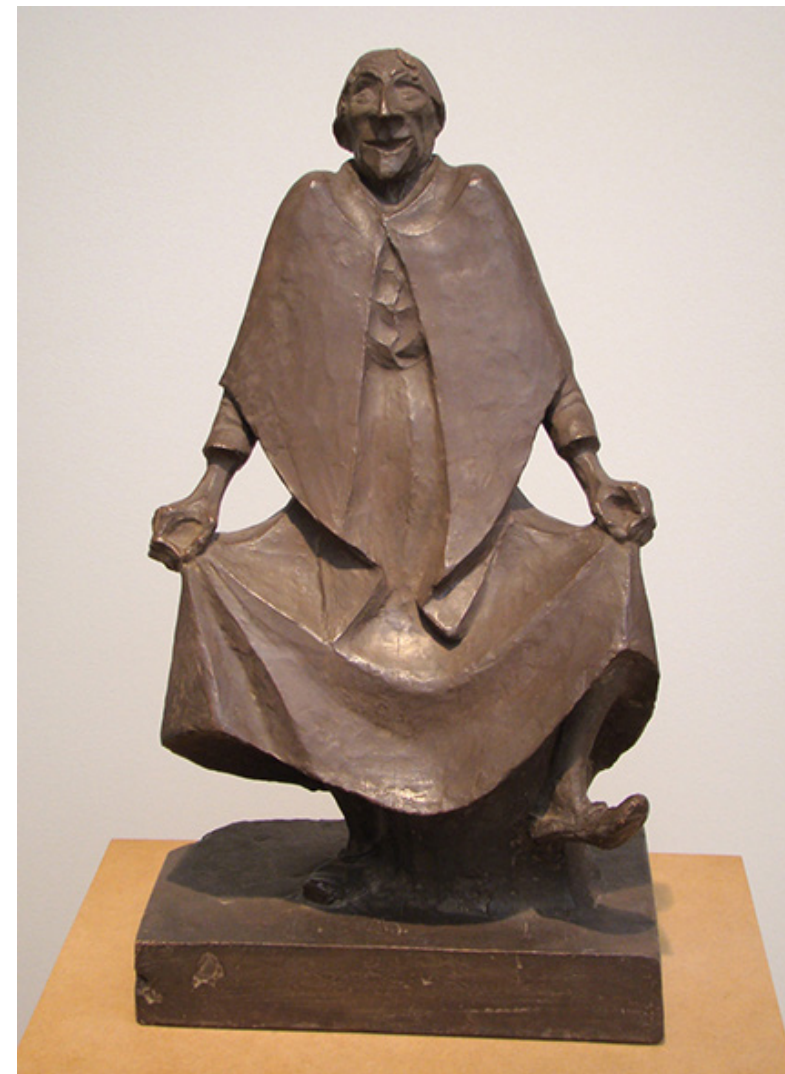
Old Woman Dancing Ernst Barlach