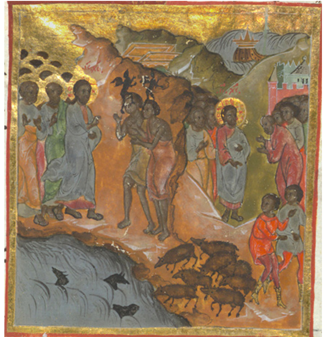
Jesus, the Gerasene, and the Unclean Spirits