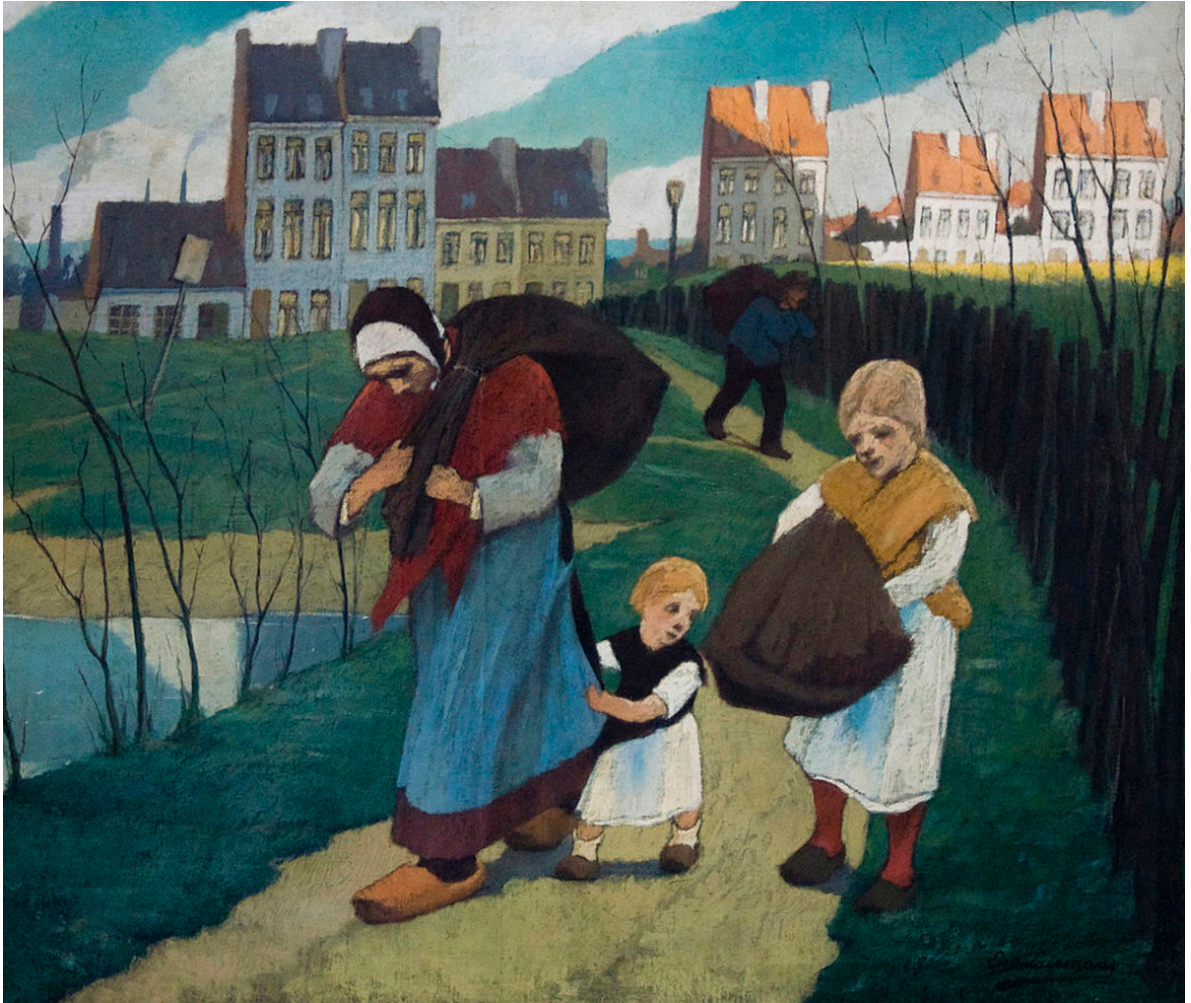
The Rag Collectors Eugene Laermans