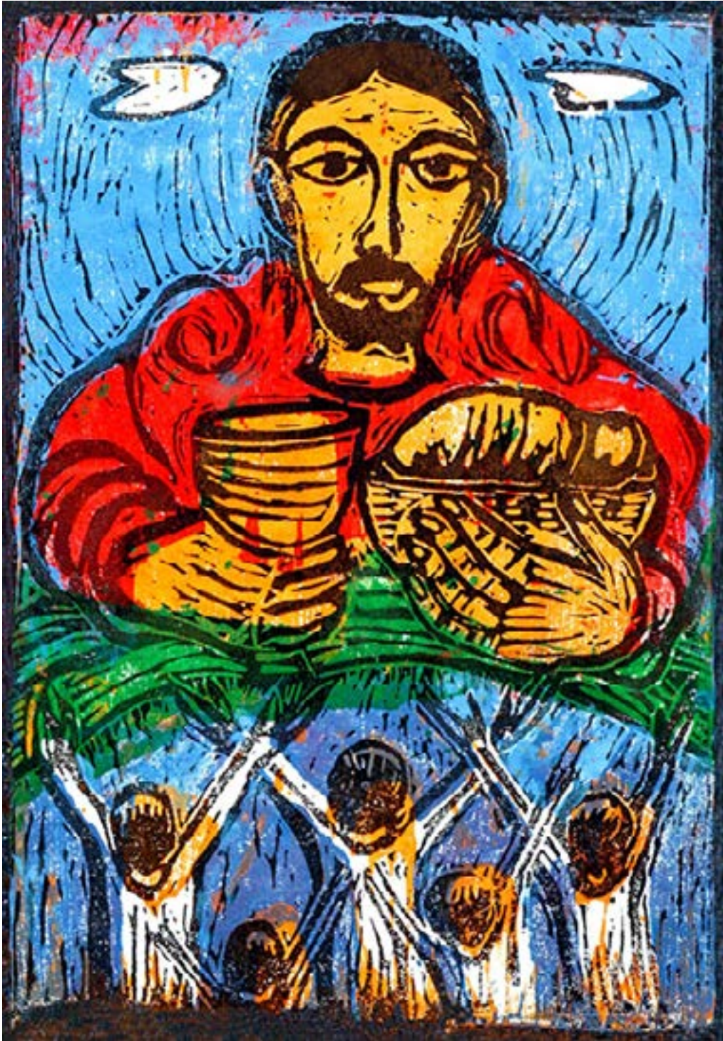
Bread from Heaven Solomon Raj