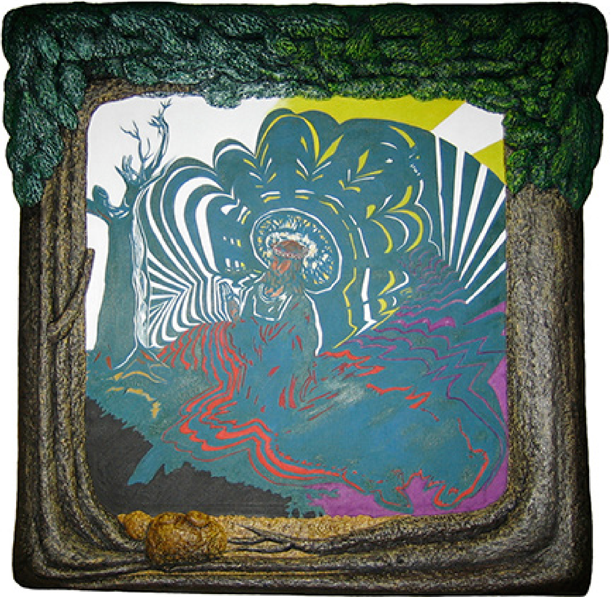
Power of The Lord's Prayer Roman Sabatini