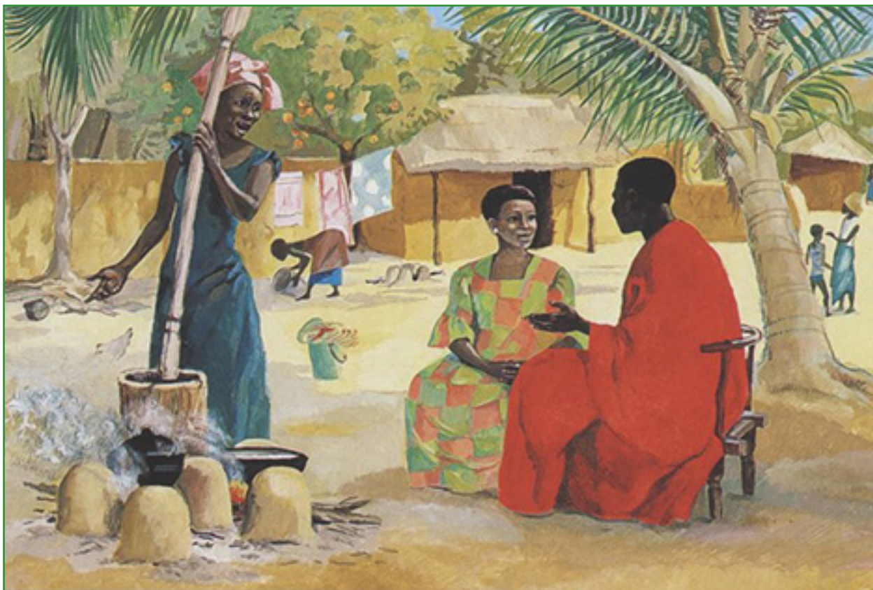
Martha and Mary JESUS MAFA