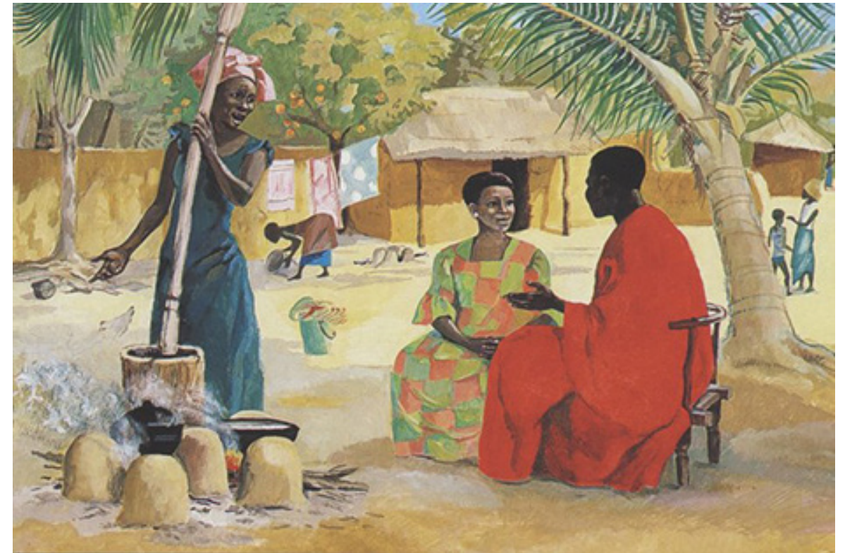
Martha and Mary JESUS MAFA