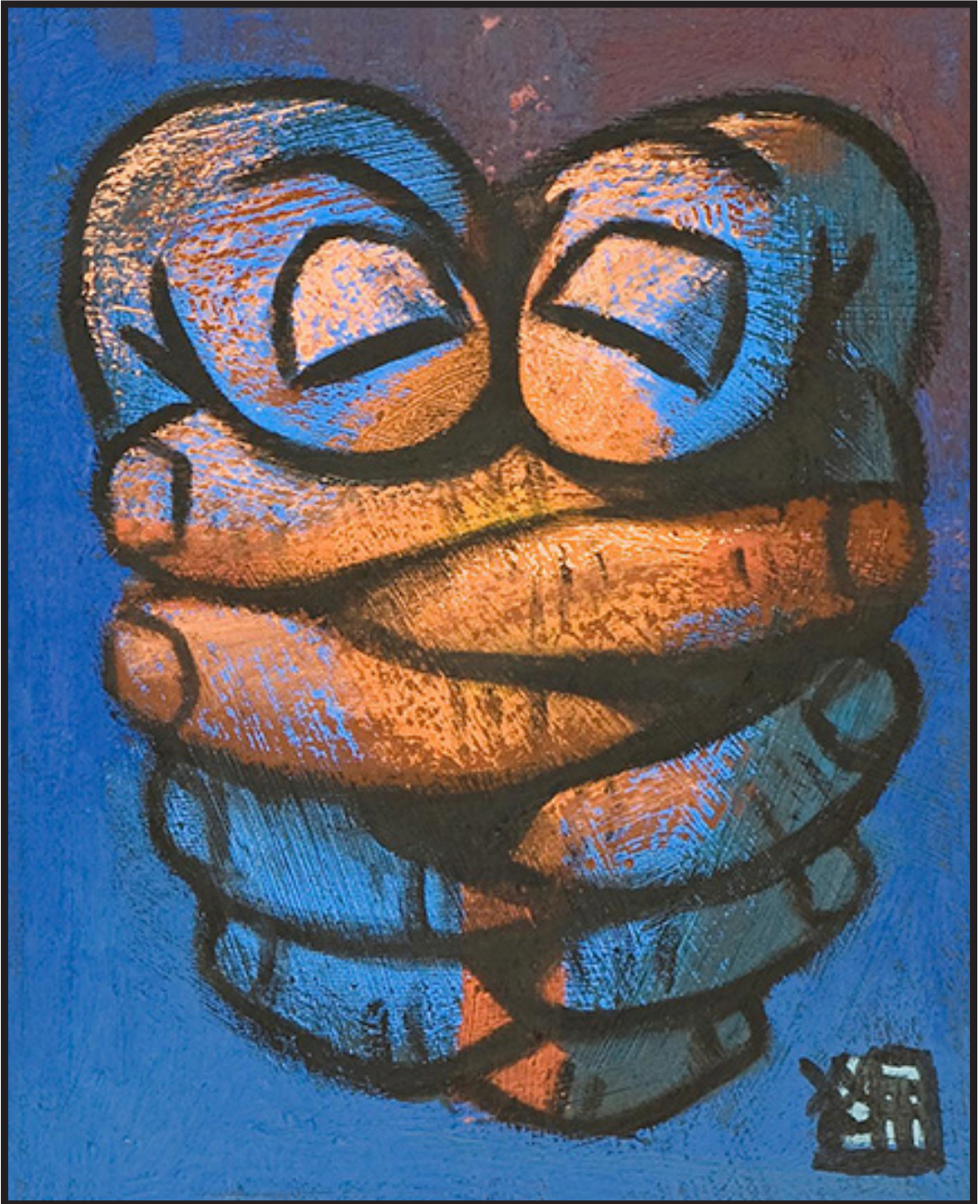
Prayer 1 | Wayne Forte

FOURTEENTH SUNDAY after PENTECOST August 25, 2024 • 9:30 AM