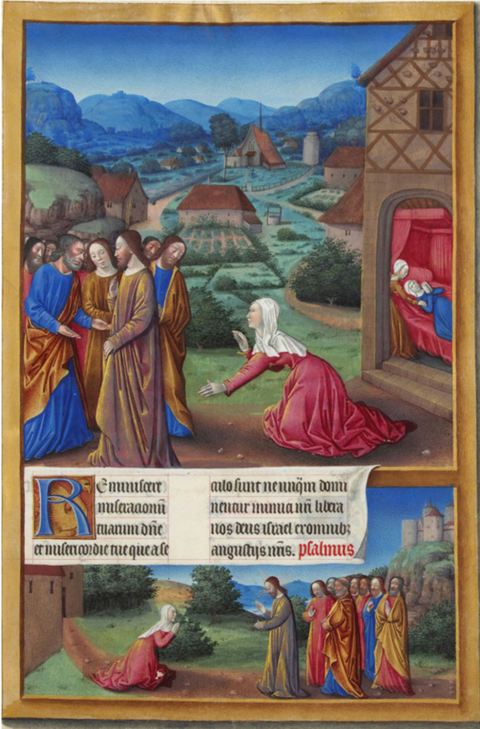
“The Caananite Woman”

TWELFTH SUNDAY AFTER PENTECOST AUGUST 20, 2023 9:30 A.M. WORSHIP